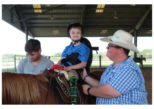
See you next year!